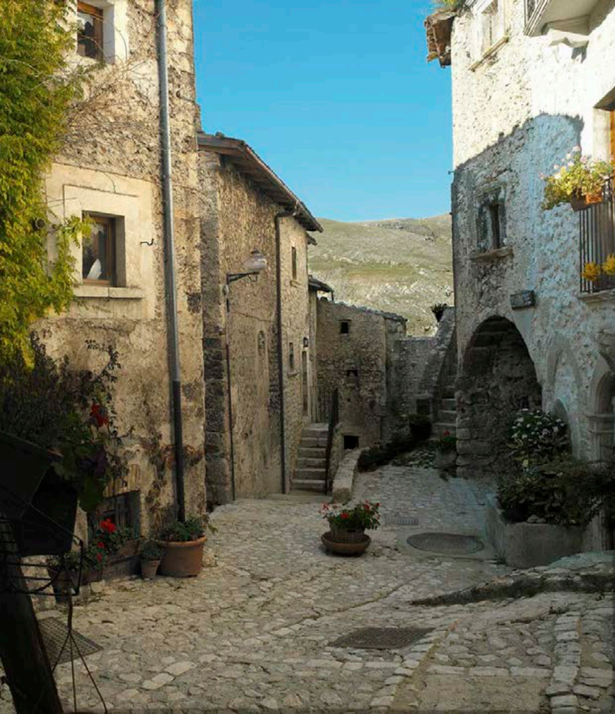
Santo Stefano di Sessanio, Italy