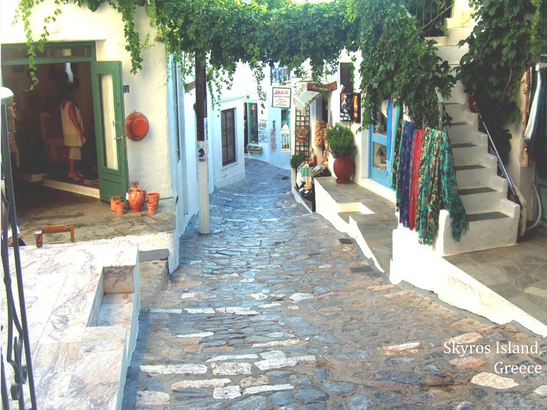
Skyros Island, Greece