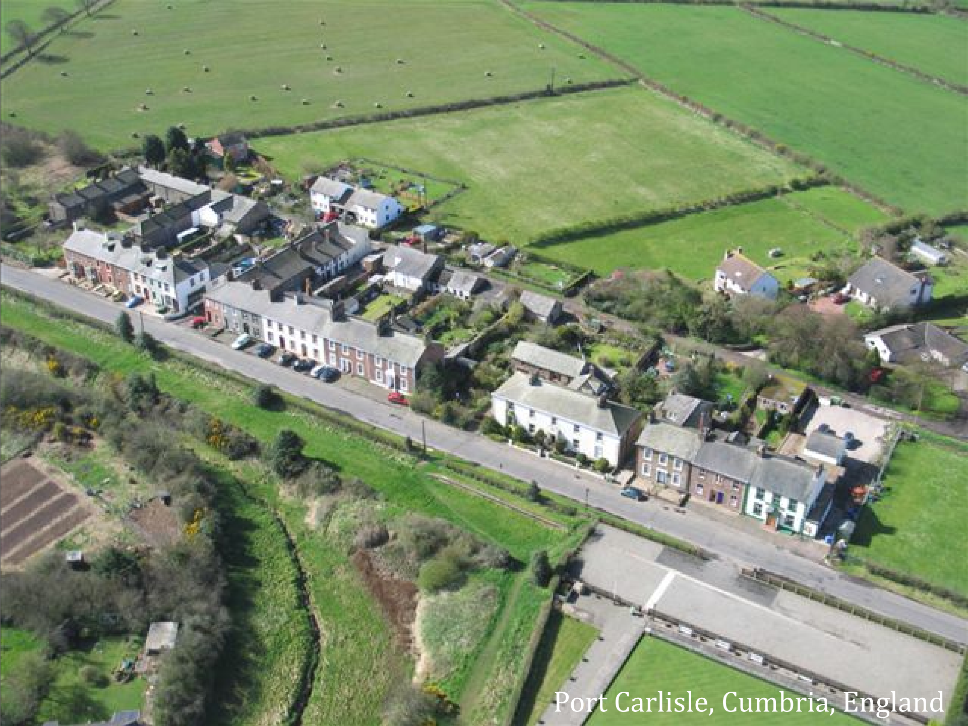
Port Carlisle, Cumbria, England