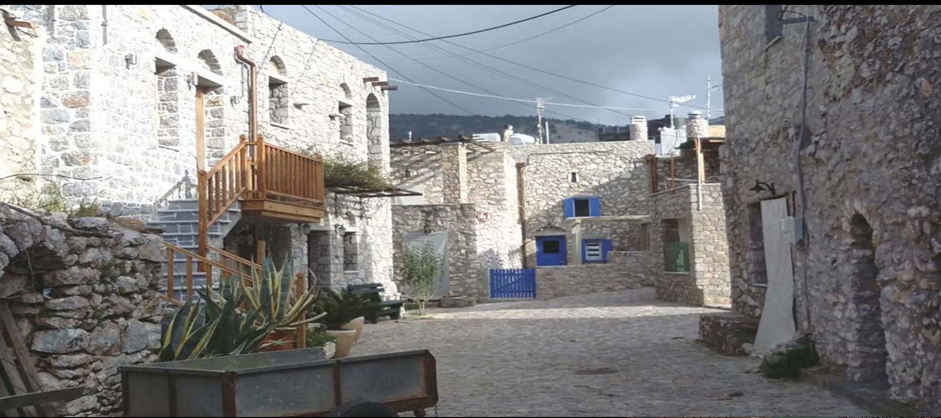
Mastichochoria , Chios Island, Greece