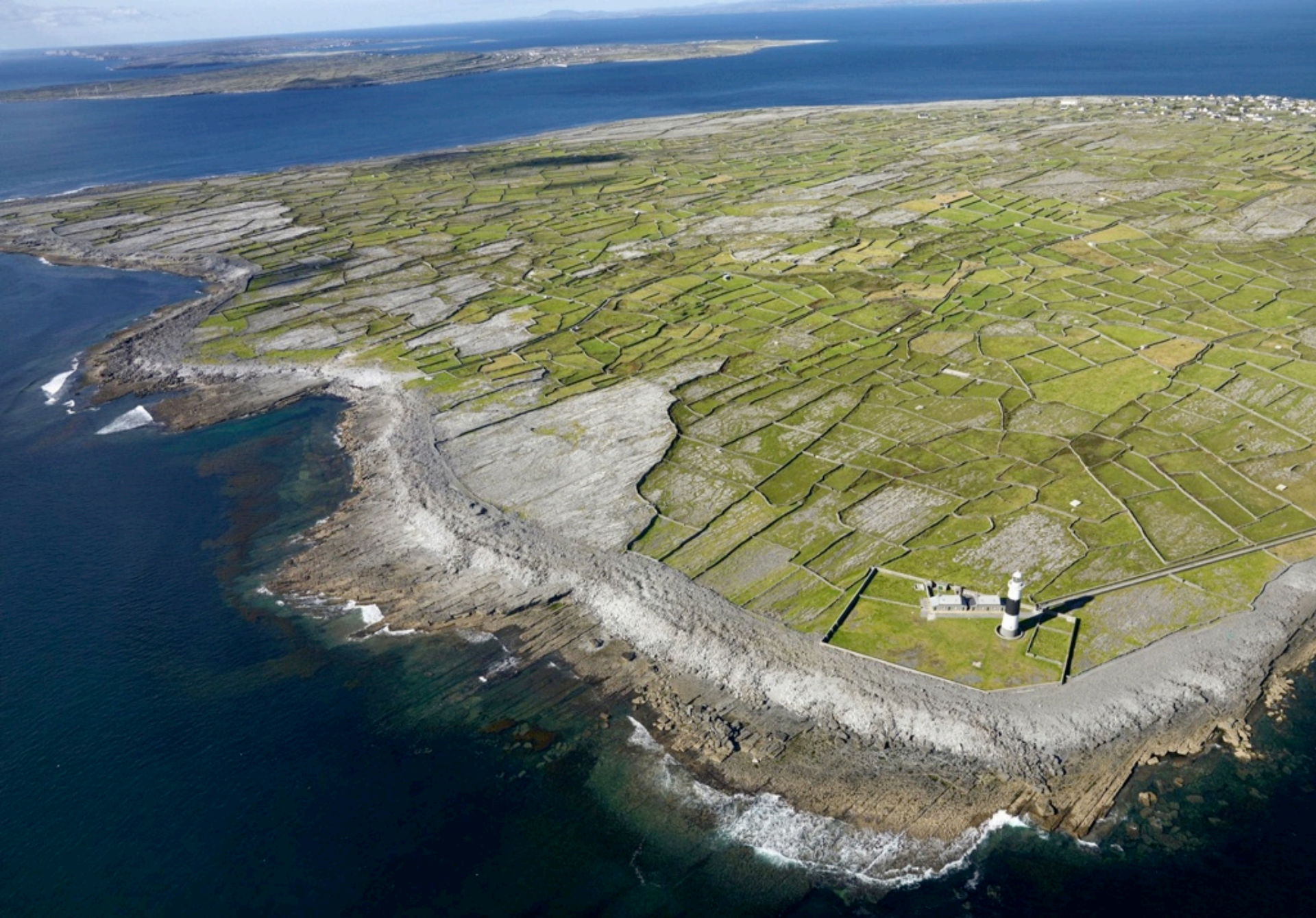
Inis Oirr, Ireland