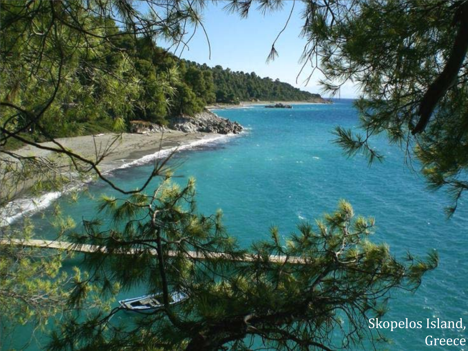
Skopelos Island, Greece