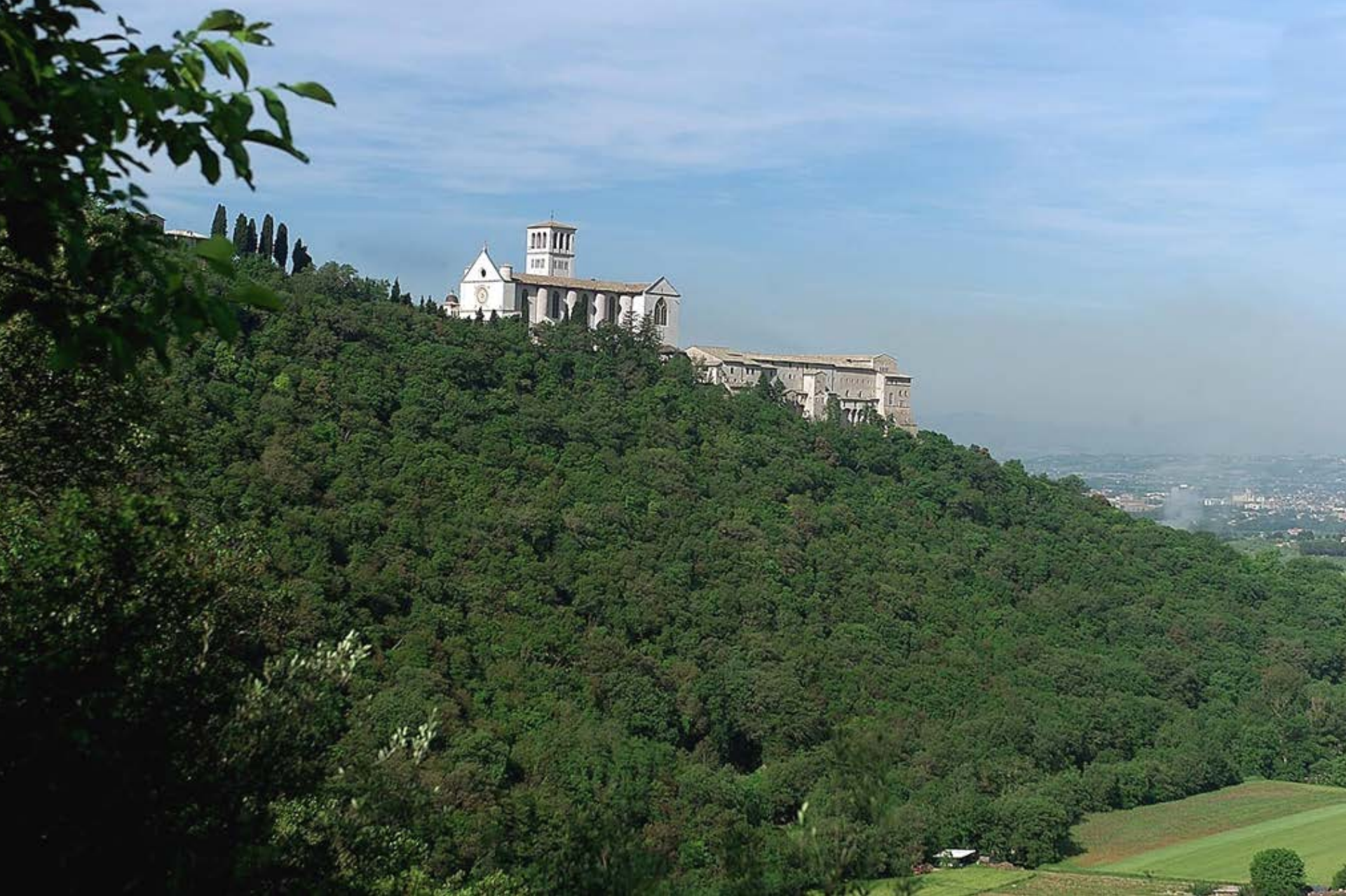
Landscape restoration project of the Forest of Saint Francis – Assisi (ITALY) Award Winner – 2013