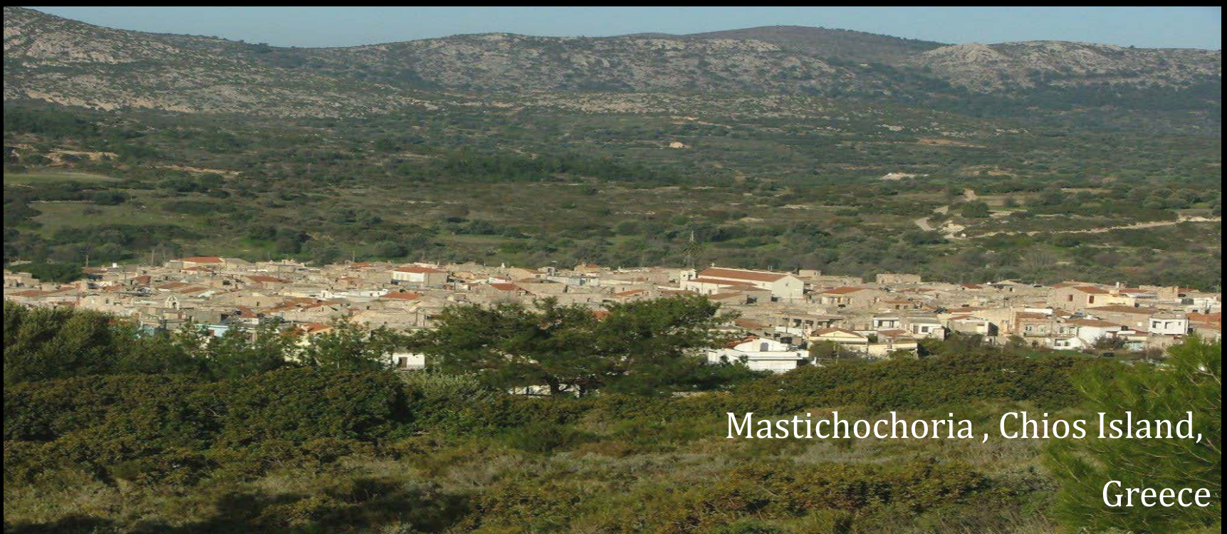
Mastichochoria , Chios Island, Greece