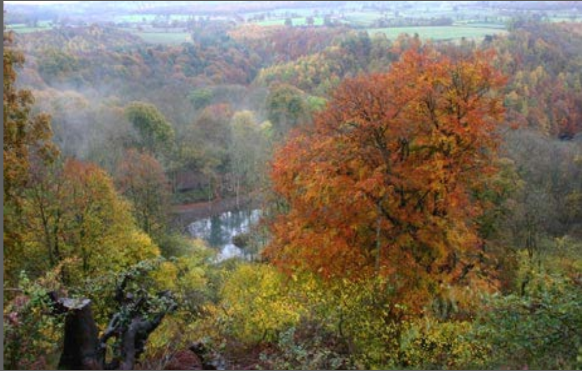
Restoration of Hackfall Woodland Garden (UK) Grand Prix Winner – 2011