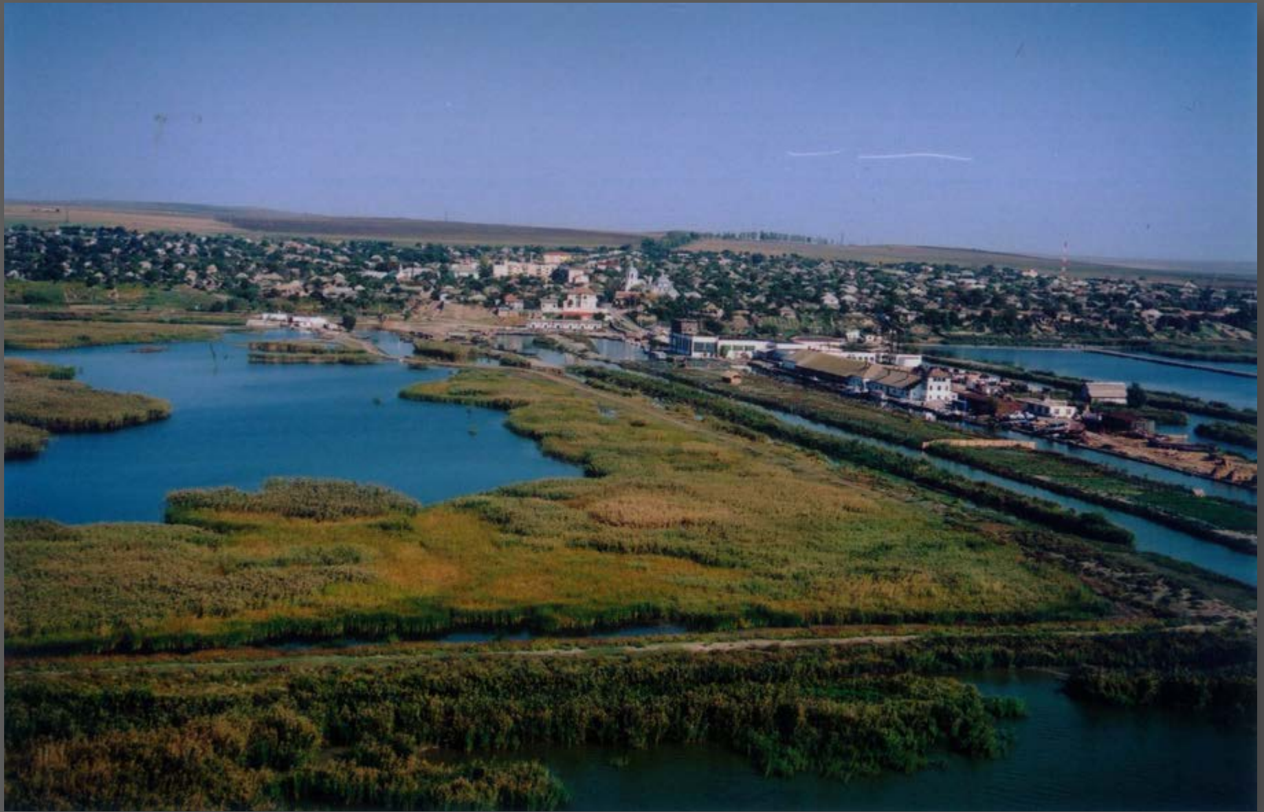
Lakes Razelm and Jurilovca, Romany