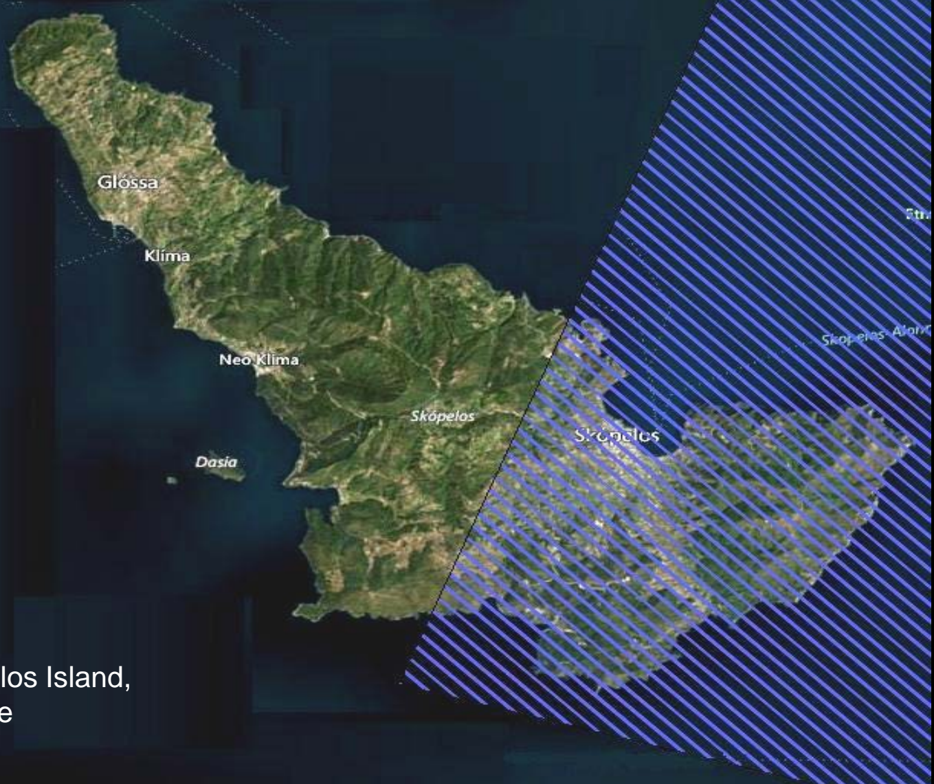
Skopelos Island, Greece