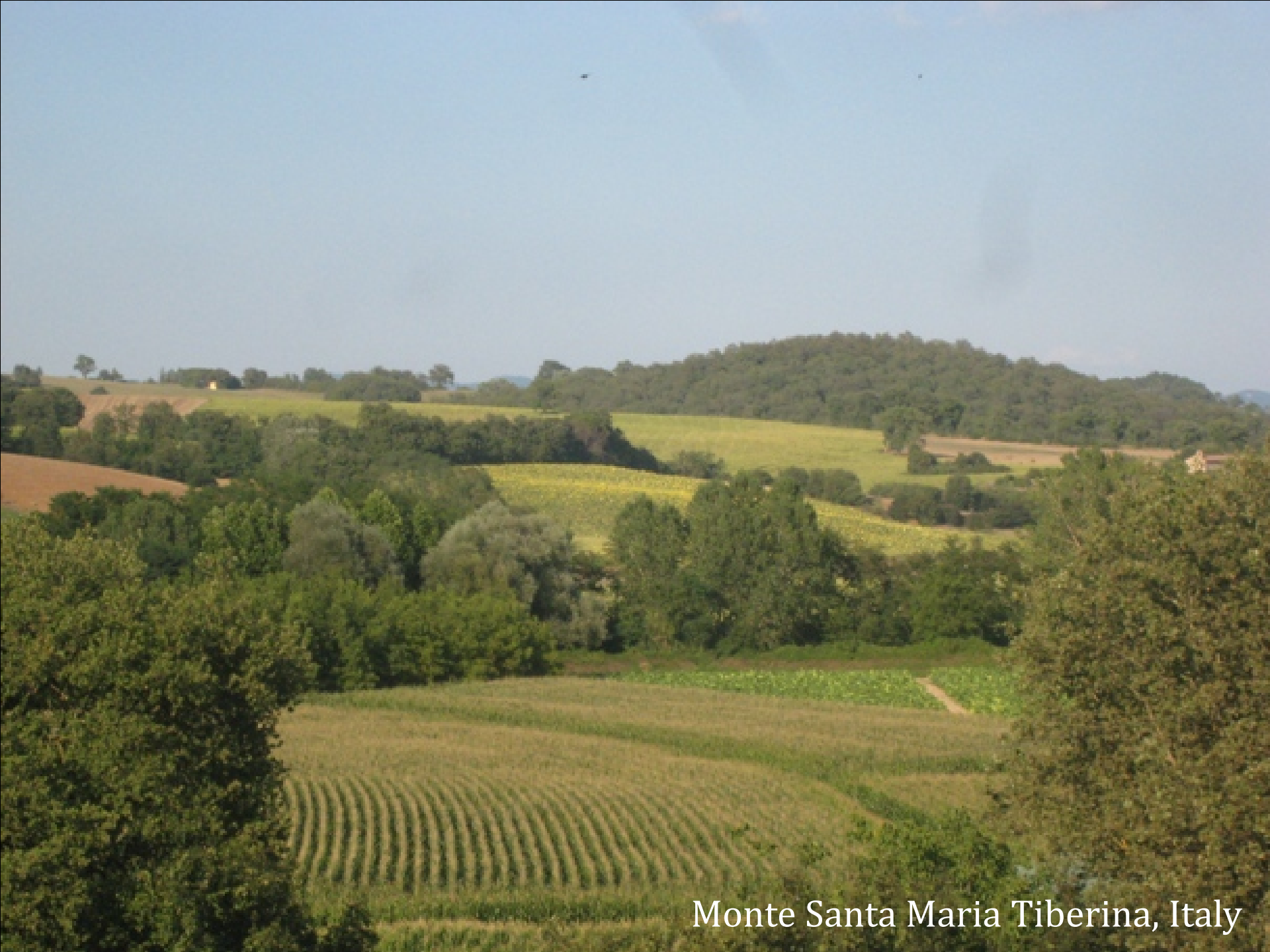
Monte Santa Maria Tiberina, Italy