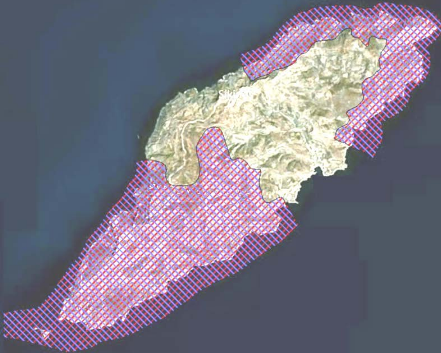
Sikinos Island, Greece