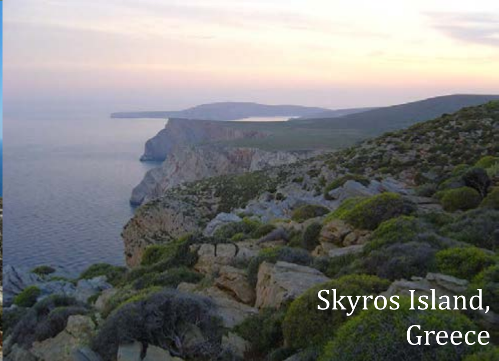
Skyros Island, Greece