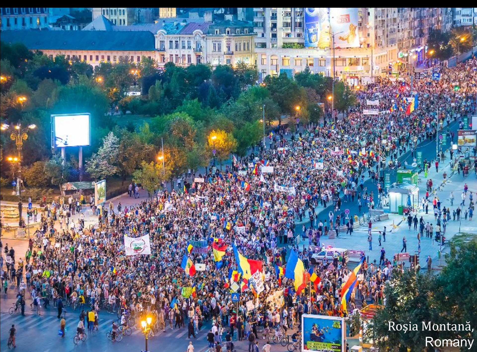
Roșia Montană, Romany