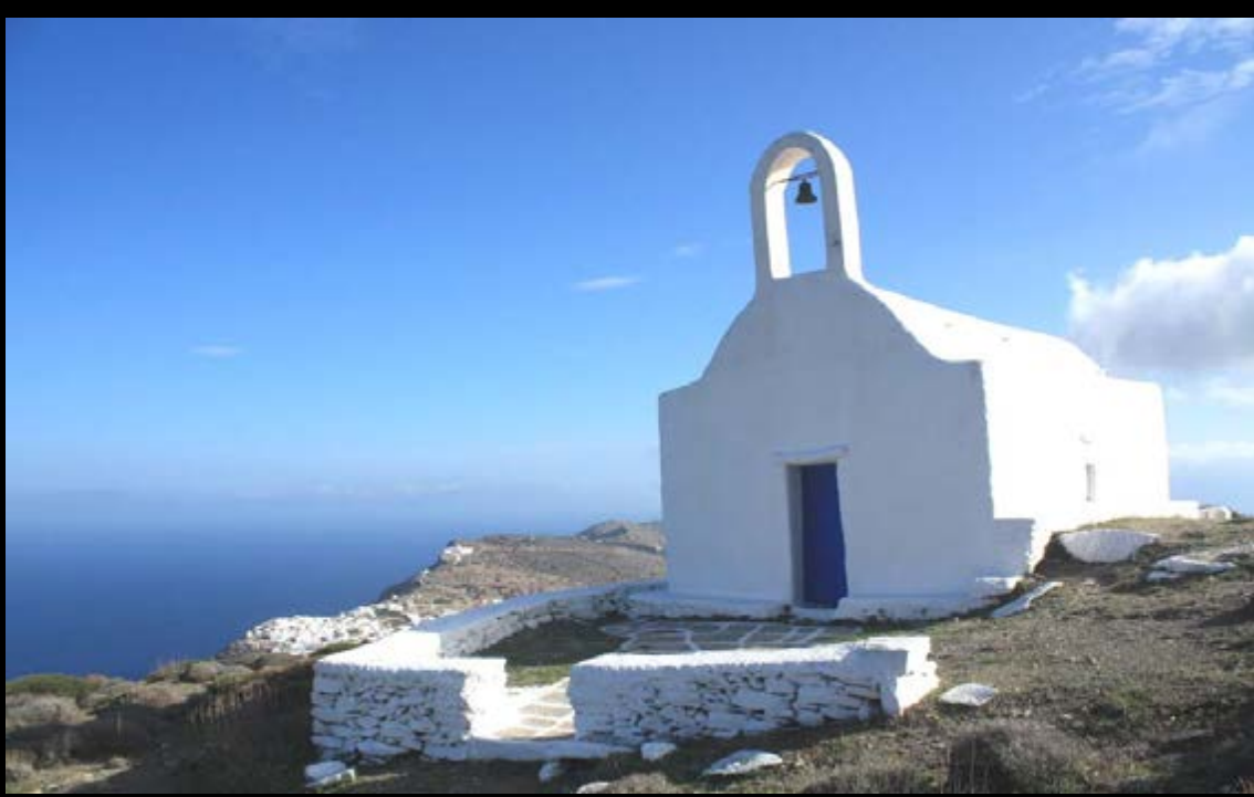
Sikinos Island, Greece