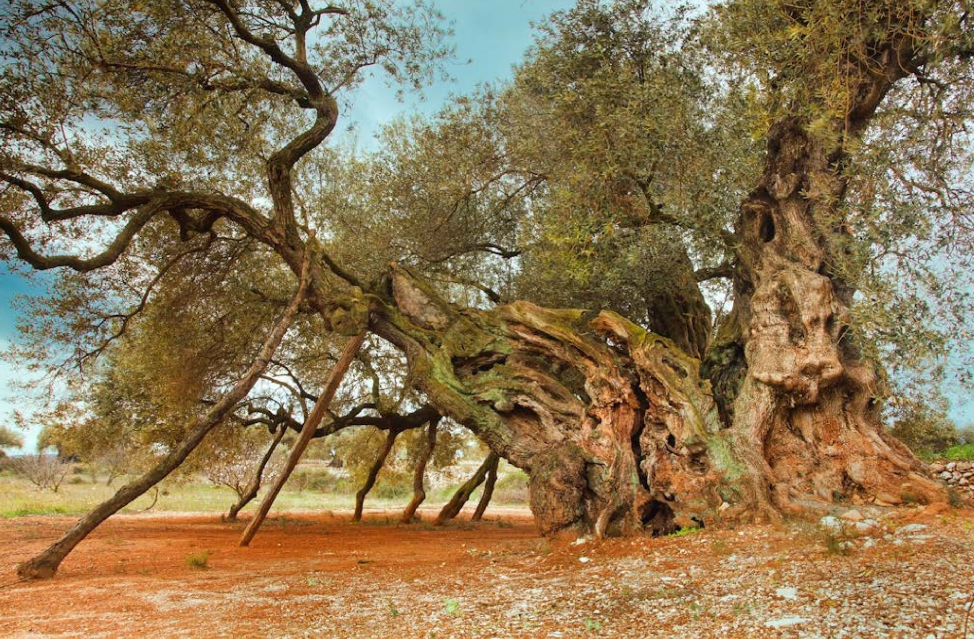
The Historical Landscape of El Sénia's Ancient Olive Trees (SPAIN) Award Winner – 2014