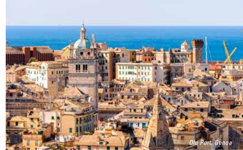
Old Port, Genoa