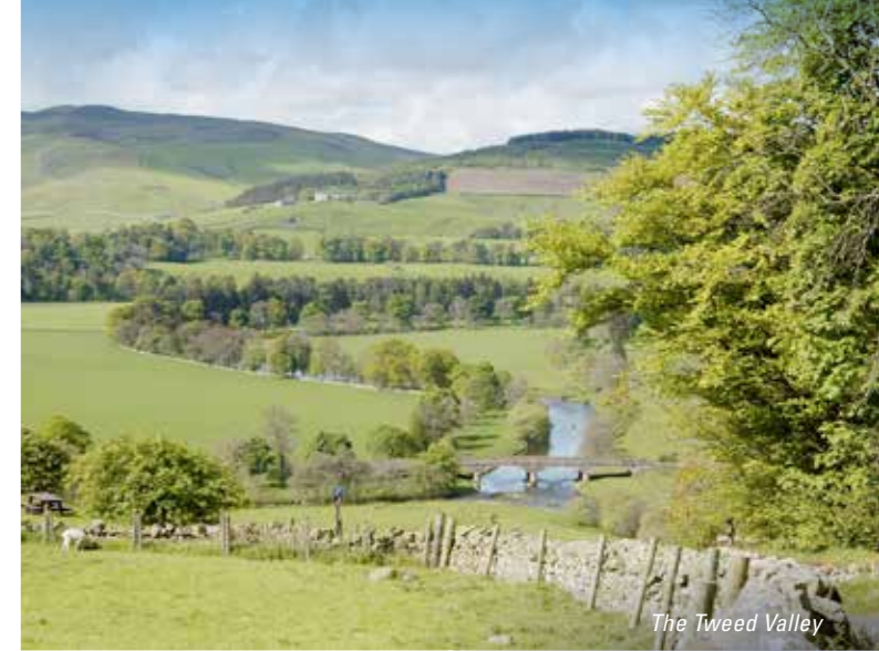
The Tweed Valley