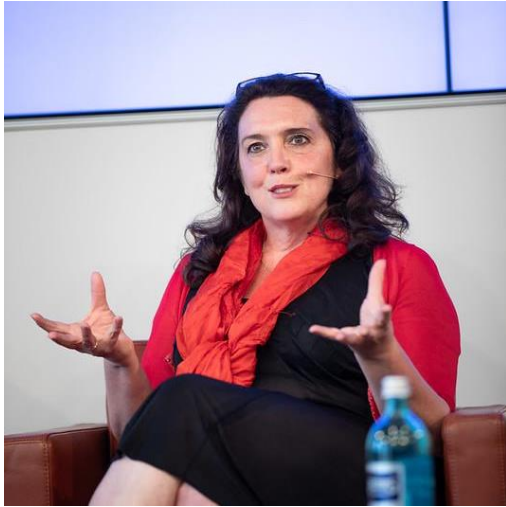
BETTANY HUGHES Historian and Broadcaster (UK)

Professor Bettany Hughes is an award-winning historian, author and broadcaster, who has devoted the last 25 years to the vibrant communication of the past. Her speciality is ancient and mediaeval history and culture. A Scholar at Oxford University, she has taught at Oxford and Cambridge Universities and lectured at Cornell, Bristol, UCL, Maastricht, Utrecht, Manchester and Swansea.