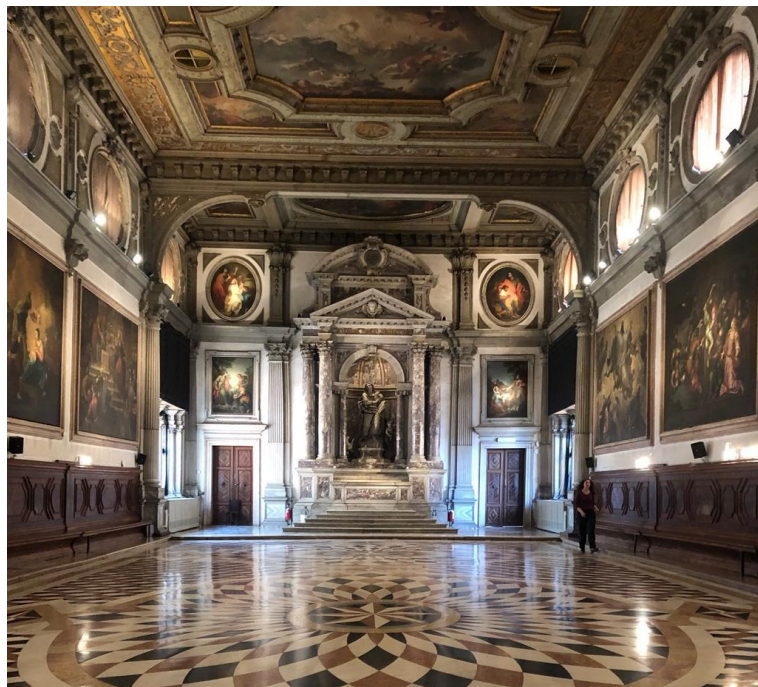
Inside of Scuola Grande San Giovanni Evangelista di Venezia

This panel will invite the speakers to share their experiences, and more importantly, their perception of the reality of promoting and enhancing culture and heritage across the European continent as a vector of togetherness and resilience for Europe's society and its citizens.