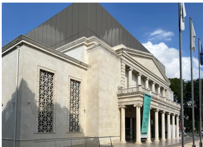
Municipal Theatre of Nicosia