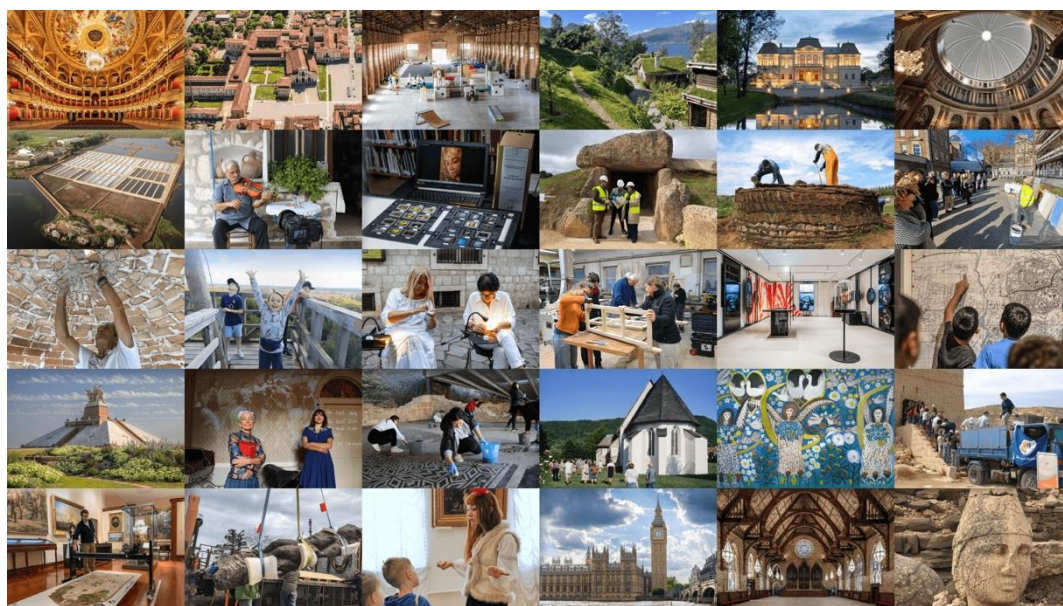
Winners of the Awards 2026.

This year's edition of the Awards features a diverse range of winners across its five categories, including the DumBO project, which has reactivated a former railway yard in Bologna through reversible interventions, creating a flexible cultural hub with strong community impact (Italy); The Cypriot Fiddler research project, which has documented the life stories of traditional Greek Cypriot and Turkish Cypriot musicians (Cyprus); the "Pacijenca" programme, which has revived, through hands-on training, the nearly extinct Dobrota lace tradition in Montenegro; the Gardens of Peace Project, which has created contemporary public gardens along the First World War front line in France and Belgium; and the volunteer-driven organisation Din l-Art Ħelwa, which has protected Malta's heritage for over 60 years.